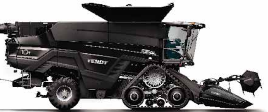
All IDEAL® combines