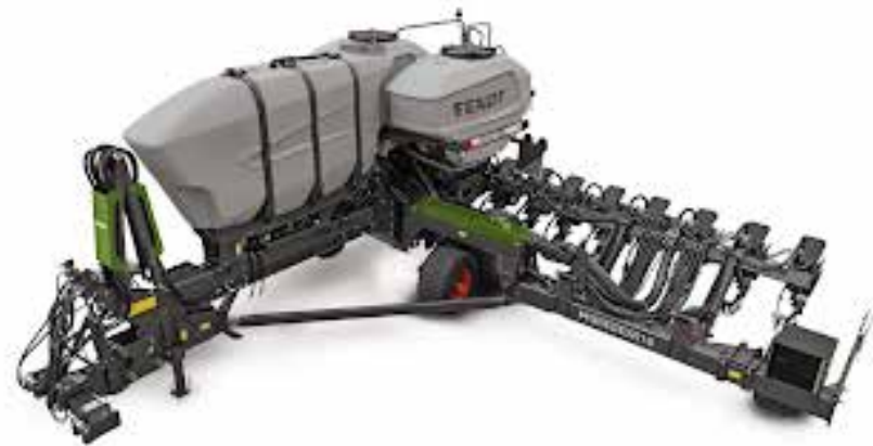
All Momentum® planters

3 years or 1,250 engine hours (whichever occurs first)