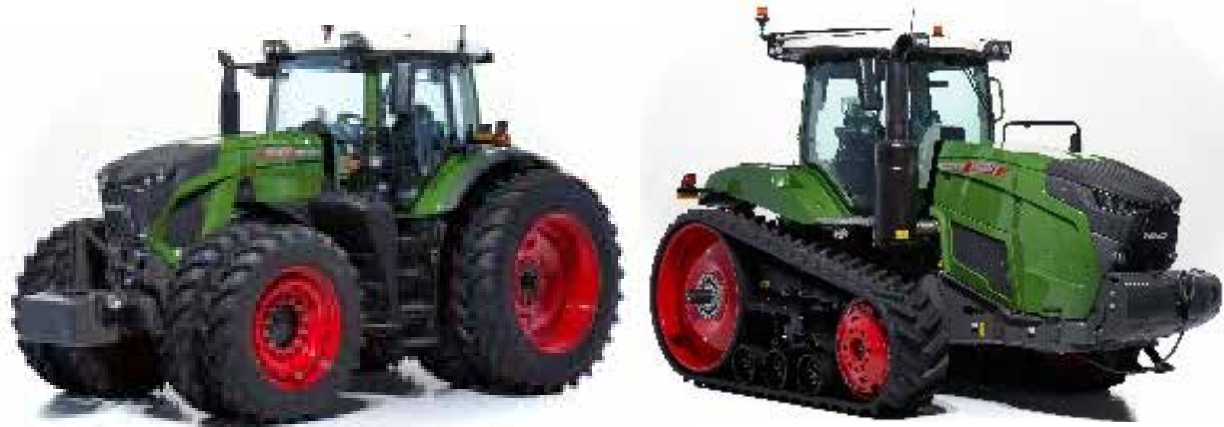
All Fendt wheel and track tractors