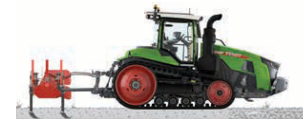
Figure 2: The 1100 Vario MT with Smart Ride Plus allows for easy adjustment of the weight distribution. This results in reduced slip, improved ride comfort, and improved overall performance.