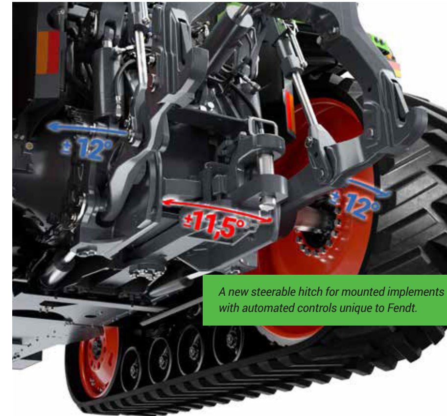
A new steerable hitch for mounted implements with automated controls unique to Fendt.

For three-point-hitch-equipped tractors, with either standard or high-lift capacities, the hitch system was designed with the mounted implement in mind. The hitch system has auto float, fixed or offset mode, which gives the operator total control of the