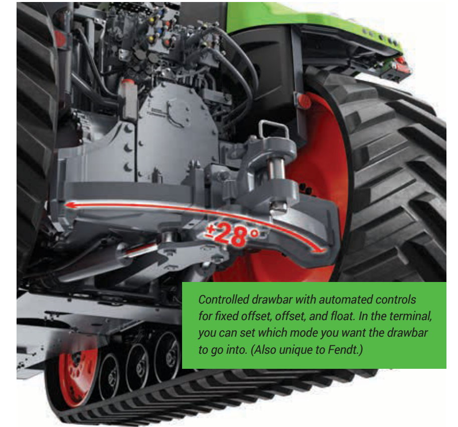
Controlled drawbar with automated controls for fixed offset, offset, and float. In the terminal, you can set which mode you want the drawbar to go into. (Also unique to Fendt.)

For three-point-hitch-equipped tractors, with either standard or high-lift capacities, the hitch system was designed with the mounted implement in mind. The hitch system has auto float, fixed or offset mode, which gives the operator total control of the