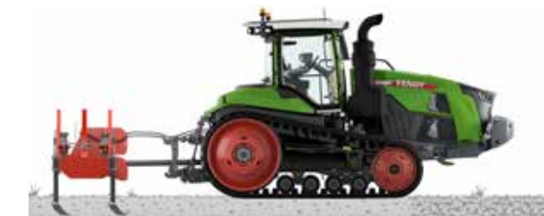
Figure 1: A tractor goes to work without proper tractor and implement weight distribution. This results in insufficient front weight on the tractor, and as a result increases slip.

When equipped with Smart Ride Plus suspension, the 1100 Vario MT features a load-leveling suspension system. With the push of a button in the cab, Smart Ride Plus uses hydraulic pressure in the track suspension elements to raise or lower the front of the machine. This results in better weight distribution for better traction, ride, and overall performance.